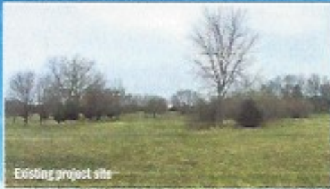
Existing project site

Facing northwest from Rambleridge Road, an artist's rendering depicts the proposed natural gas generation site located near North 120th Street & Military Road. This location would include RICE technology and supporting structures for generation, along with a substation for transmission.