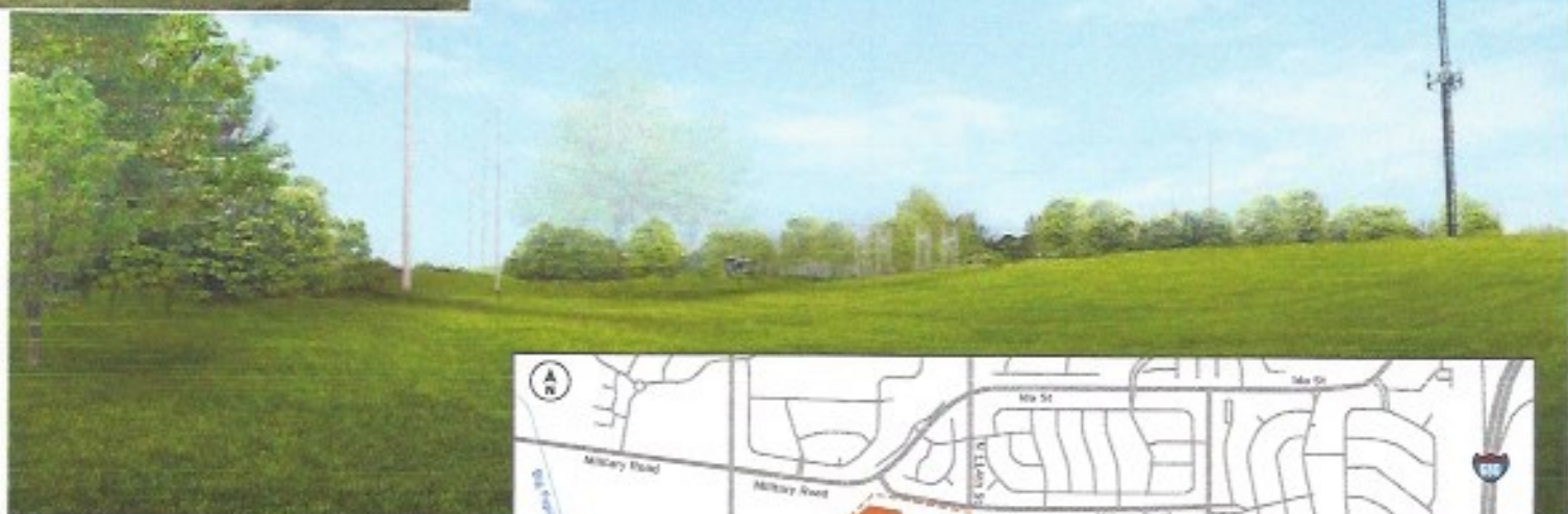
Facing southwest, an artist's rendering depicts the proposed natural gas generation site located near North 120th Street & Military Road.