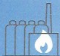
Existing project site